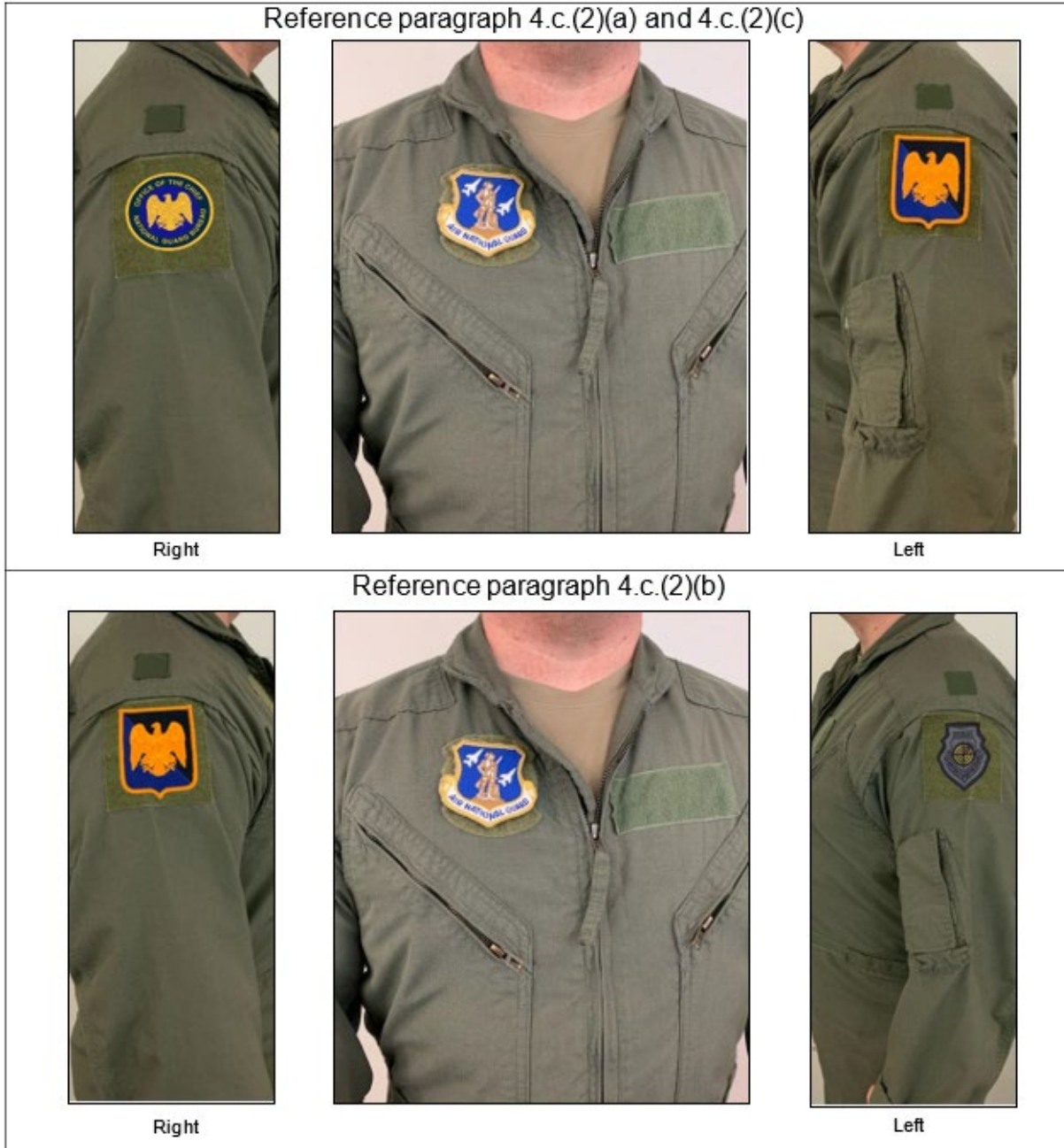
Figure 5. Wear of NGB Patch on Air Force One-Piece Flight Duty Uniforms