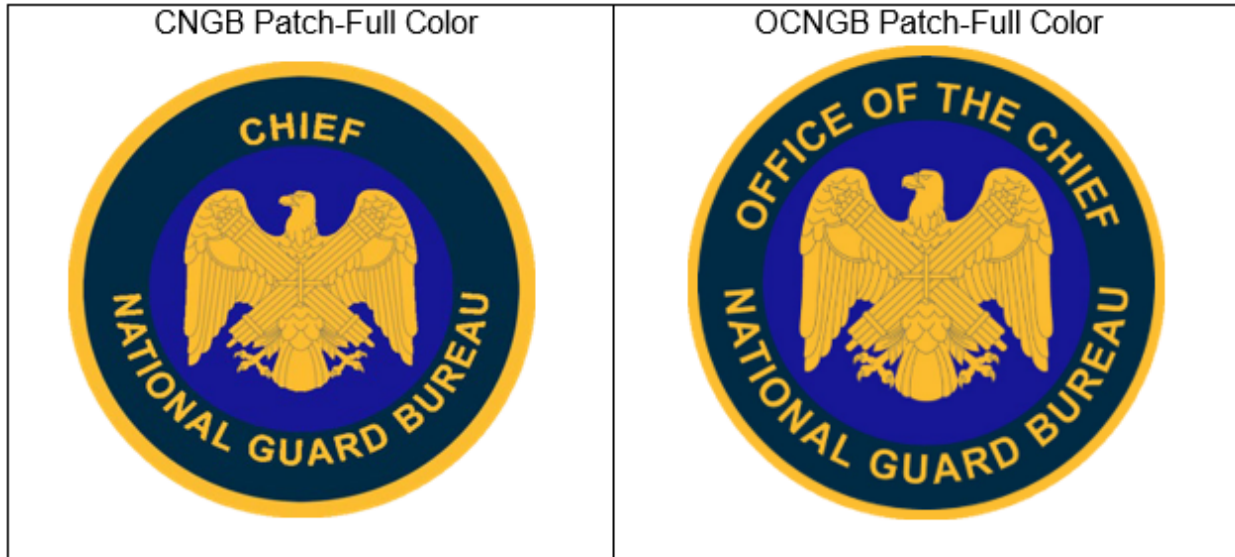
Figure 2. CNGB and OCNGB Patches

Note: Only Air National Guard Service members assigned to the OCNGB are authorized to wear the OCNGB patch. It is worn on the right shoulder sleeve.